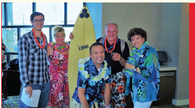
Marriott Hotel Mixer