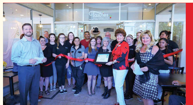
Tastries Bakery Ribbon Cutting