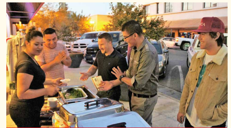
Taste of Downtown